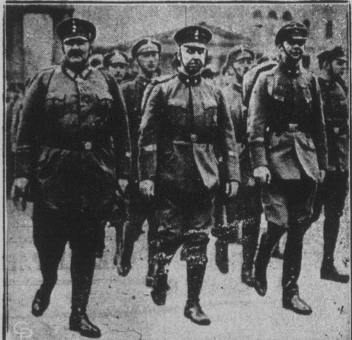
An unusual picture showing three princes of the Imperial House of Hohenzollern marching in the van of a parade of 25,000 members of the Steel Helms organization in Berlin during the recent German election. LEFT TO RIGHT, the princes are: Prince Eitel Friedrich and Prince Oscar, both sons of the former Kaiser, and Prince Heinrich, son of the former Crown Prince Wilhelm. Following the victory of Chancellor Adolph Hitler in the elections the flag of Imperial Germany is once more the national emblem.