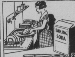
To deodorize dishes that have been used either for raw or cooked fish, add two tablespoons of baking soda to the soapy water in which they are washed.