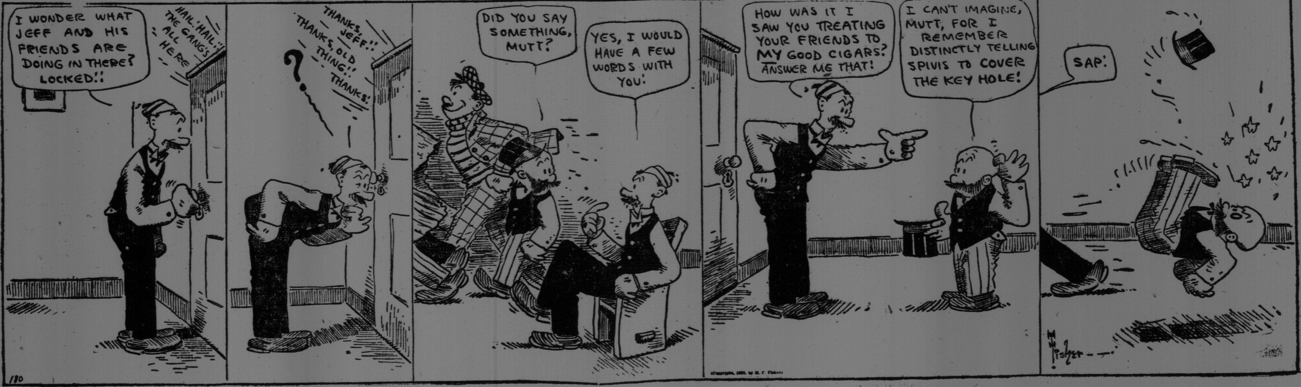
MUTT AND JEFF—EVIDENTLY SPIVIS FAILED TO CARRY OUT JEFF'S ORDERS -By "BUD" FISHER