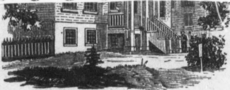
Boys' School, POINT-AUX-TREMBLES.

Montreal : "WITNESS" PRINTING HOUSE, 33, 35 AND 37 ST. BONAVENTURE STREET.