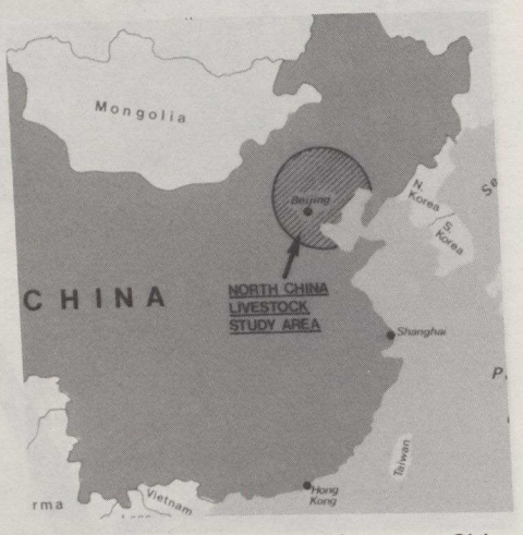
Map shows area in northeastern China where Agrodev Canada is sharing its agricultural expertise.

In 1981, worried about the future ability of these ranges to support livestock, China and the International Fund for Agricultural Development initiated a drive to rehabilitate the endangered pastures and sent out a world-wide call for consulting advice. The company