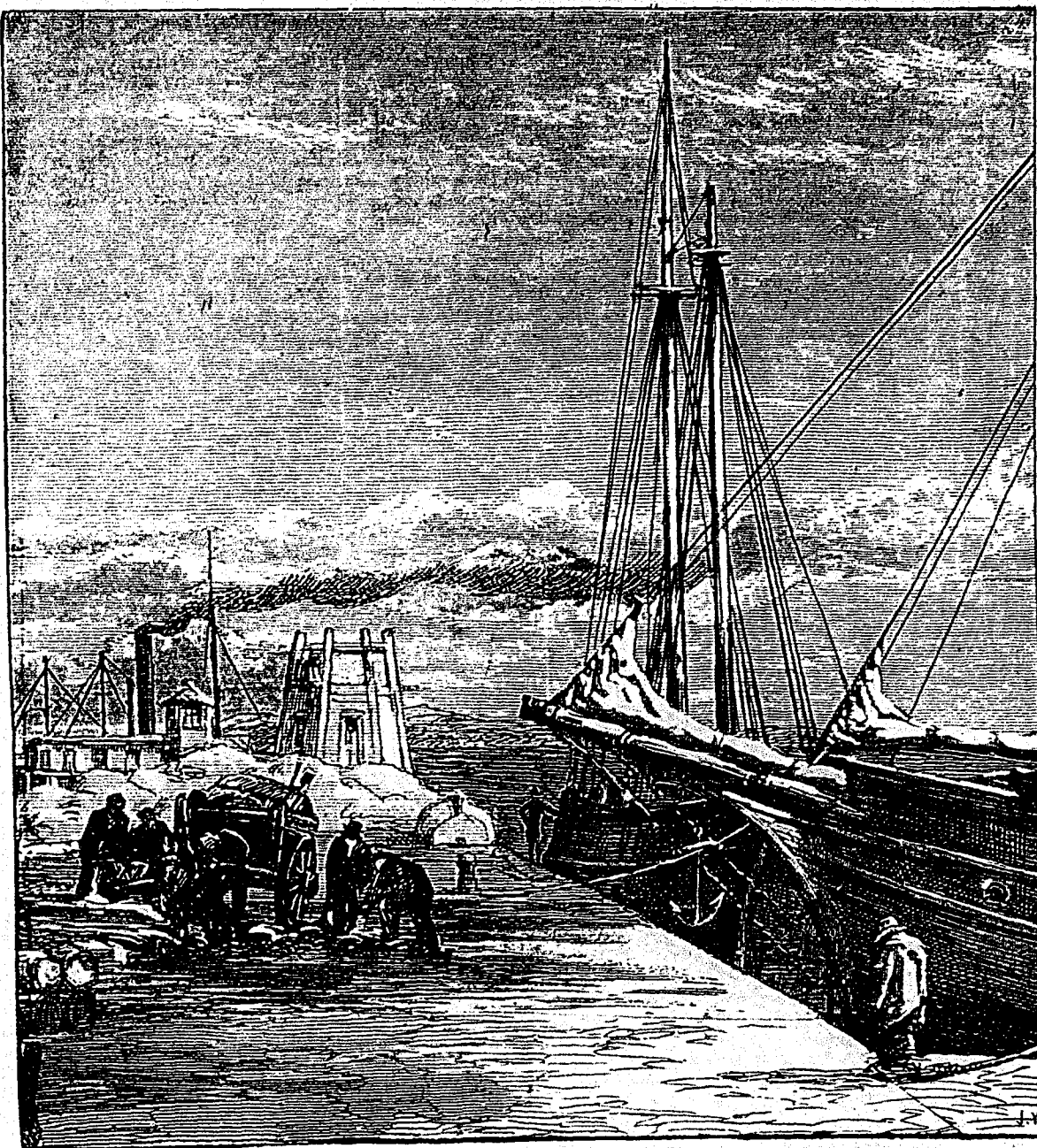
MONTREAL—ISLAND WHARF. PUTTING UP THE LIGHT-HOUSE.

Although the inscription speaks for itself, it may be interesting here to state briefly the circumstances which led to the establishment of the fort by the French. Previous to 1749 Forts Frontenac and Niagara were the only posts to guard the interior of Western Canada from the incursions of the Iroquois of New York State, who had always been a source of great annoyance to the inhabitants of Canada. It was customary for the shrewd English Colonists of New York to despatch bands of Iroquois to Canada to traffic with the native Indians for furs, and they generally returned from these expeditions with a moderate supply of furs and a very liberal supply of scalps. The two existing forts proved insufficient to shut out the traders and marauders, who made their way into the North-West by the route of the Humber River. The agitation for a protecting fort at that point had been renewed again and again, but nothing was done. By the middle of the eighteenth century, however, the establishment of a French trading post there had become a necessity in consequence of the rising importance of the post established by the English at Choueguen, now called Oswego,