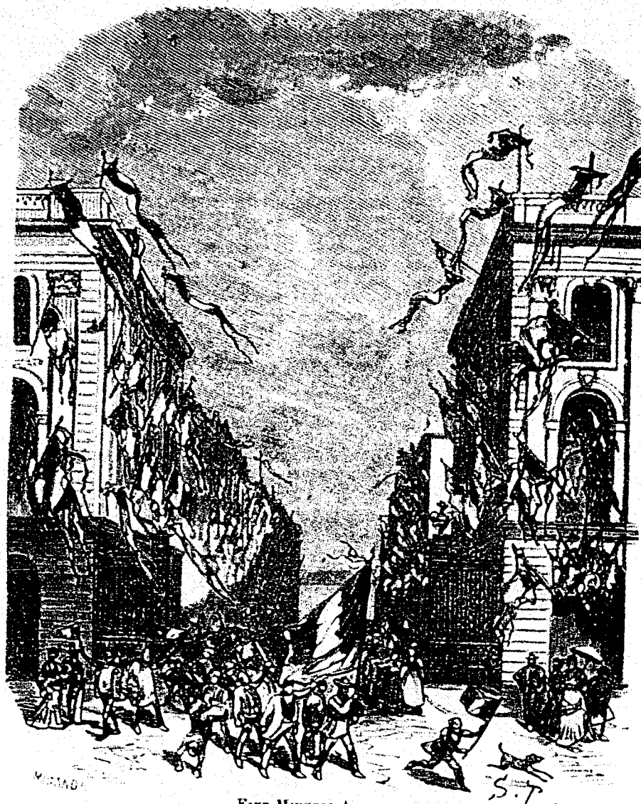
FIVE MINUTES AFTER.