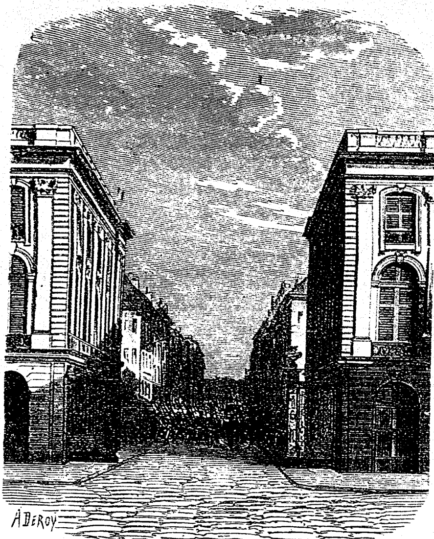
FIVE MINUTES BEFORE.