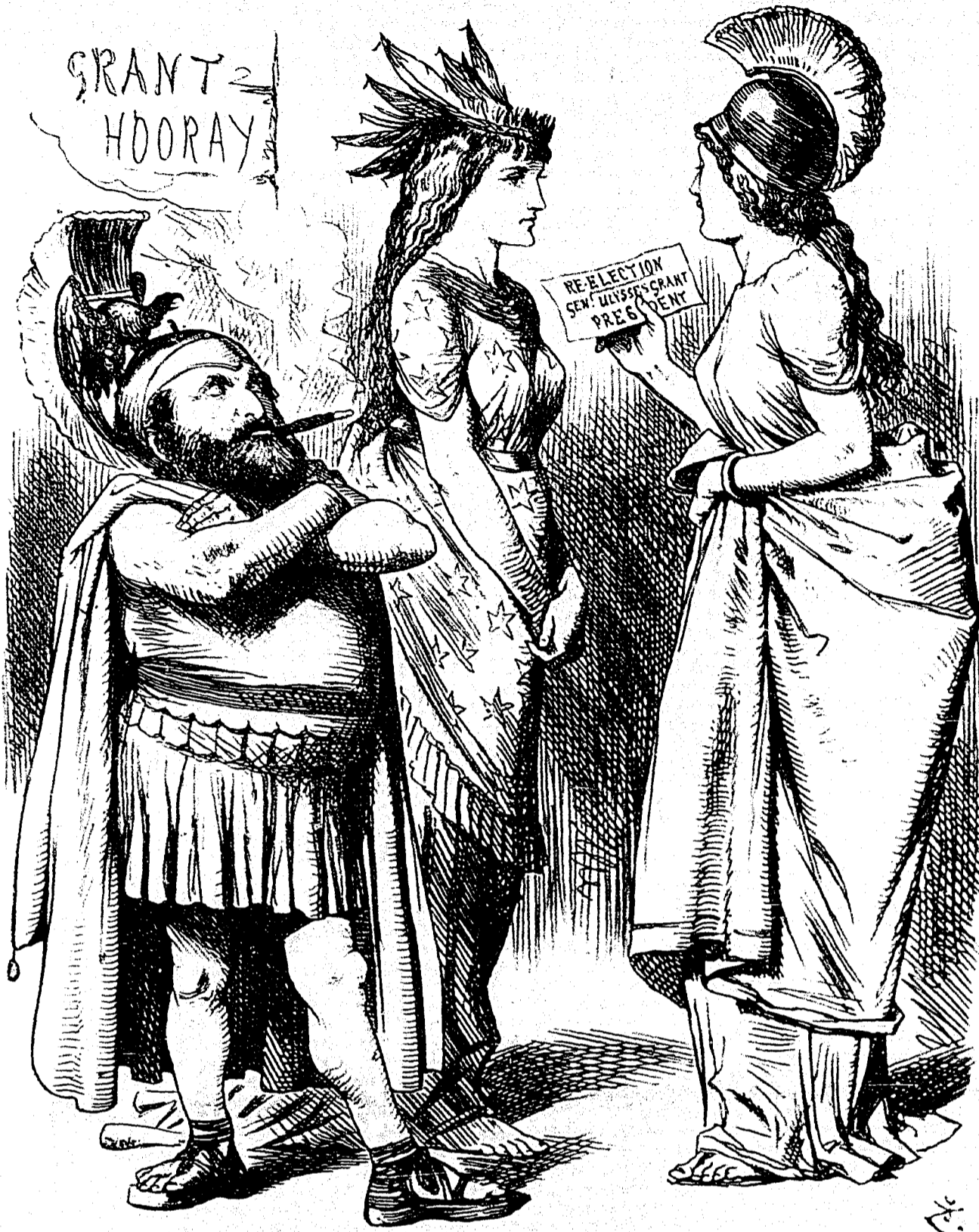
THE RETURN OF ULYSSES.

BRITANNIA.—"Ah, my dear! I was certain you wouldn't turn away the general. He may smoke too much and be too fond of his relations; but, at any rate, he's been a good and faithful servant to you!" FROM PUSCH.