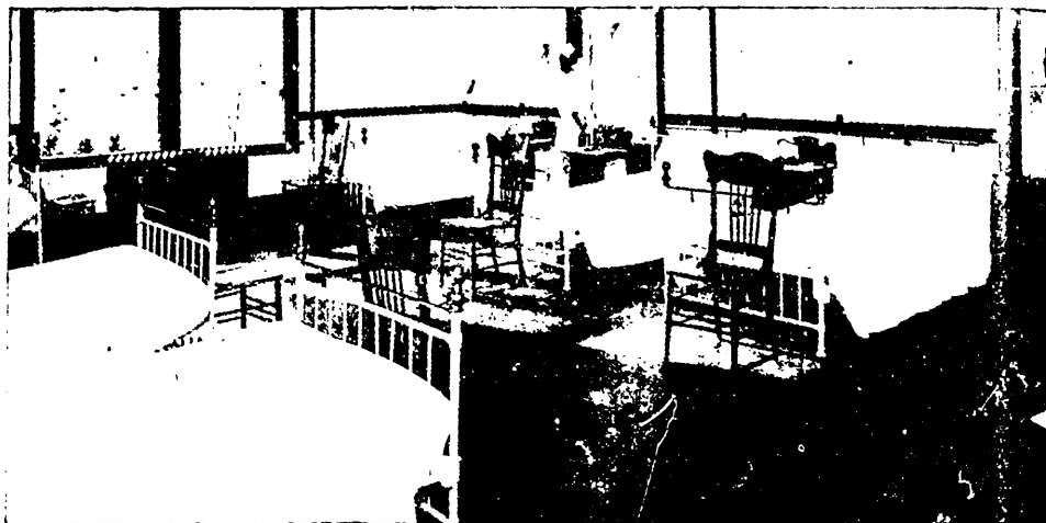
ONE OF THE BRIGHT, CHEERY WARDS OF THE MUSKOKA FREE HOSPITAL FOR CONSUMPTIVES.