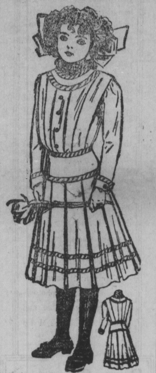
A SMART SCHOOL DRESS.

A wrapper for the elderly woman has just been designed that is on the princess style. It has the appearance of being tight fitting, but is really loose and comfortable. The front seams do not begin at the shoulder, but start at the darts and continue to the hem. The dress closes with large buttons down the entire length of the front, and the plain sleeves button from