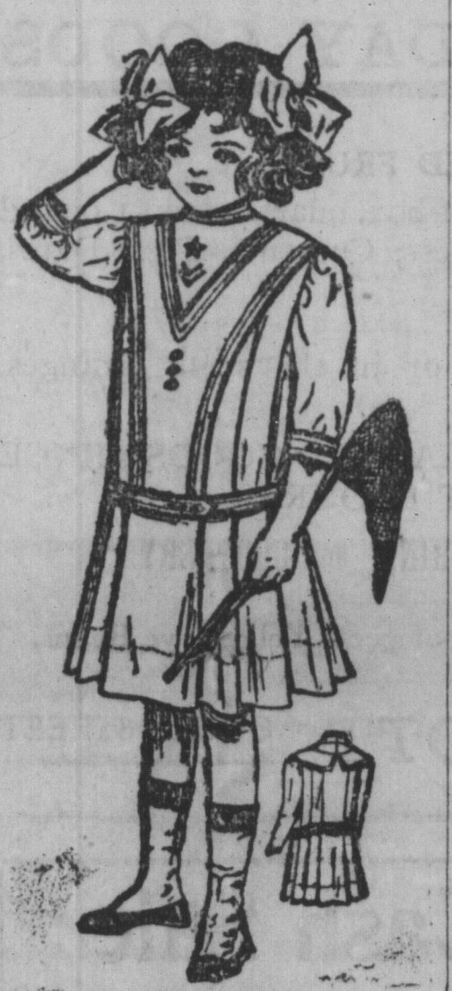
A SMART FROCK.

For quick effects few kinds of handiwork equal embroidery with coronation braid. It is simple in method, the materials are inexpensive, and there is no intricate stitching. While coronation braid has been in favor for several seasons, it holds its own with surprising tenacity. There are several new kinds of this braid, and in buying