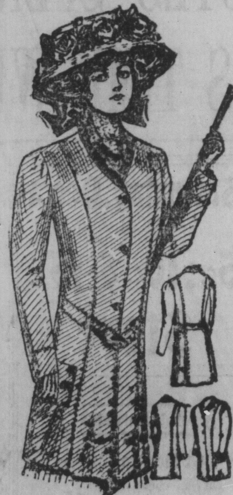
GIRL'S COAT ON NORFOLK LINES.

Draped Overskirts to Figures Prominently in Fall Fashions. Draped overskirts and festooned sashes are to be modish this fall. For evening wear draped skirts are almost exclusively shown, but for general use the fashion is not so adaptable. Scarfs and ribbon sashes are added to lingerie frocks to give the desired new effect. Sometimes a sash is brought around the waist to the front and then taken back, suggestive of panniers, and knotted at the left side or in the back. Only a tall, slender girl could stand