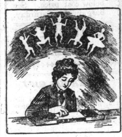
MAKING THE FIGURES DANCE.

With the help of electricity in its simplest form a great many tricks and entertaining feats can be performed, such as the following: Get a plain sheet of glass about 12 inches long by 8 inches wide and insert it between two volumes, as shown in the illustration. The distance of the glass from the table should be about three inches. With the help of scissors cut a number of small figures, such as men, women, clowns, animals, etc., not higher than 1 1/2 inches, out of different colored paper. Lay the little figures flat in a line on the table underneath the glass.