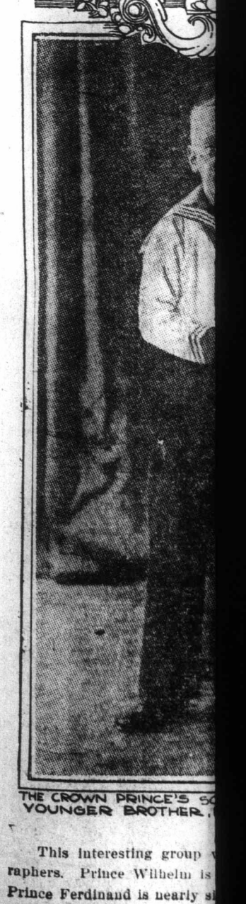
THE CROWN PRINCE'S YOUNGER BROTHER. This interesting group of rappers. Prince Wilhelm is Prince Ferdinand is nearly 50