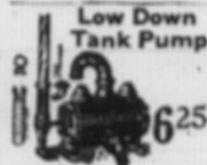
The all reliable, never fail pump. The one to give you best service. Shipped complete with strainer. Weight, per Price each $6.25

Cut in 4 or 12-inch Per ft. $1.20 In sides, Per ft. $1.00