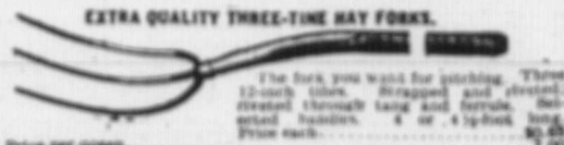
EXTRA QUALITY THREE-TINE HAY FORKS. The fork you want for catching. Three 12-inch tines. Strapped and riveted. Made through long and heavy. Special heads. 4 or 4 1/2 inch long. Price each $0.45. Price per dozen 7.20