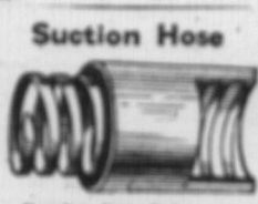
Genuine Red Jacket wind-laid hose. Heavy and lasting. 2-inch inside diameter. 20-foot length. Price $ 8.00. 25-foot length. Price 10.00