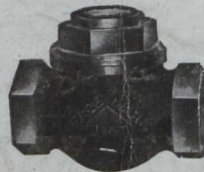
Also Check, Angle and Stop Valves

"Every Installation is a Demon- stration of Merit." Write for our Marine Specialty Booklet.