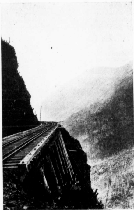
PAYNE BLUFF ON K. & S. RAILWAY, 1,000 FEET BELOW.

is a double-track tunnel, and is one of the best and largest tunnels in the Slocan. A force of about 60 men is employed and shipments are being made at the rate of two cars of ore per week. A quantity of ore has lately been discovered in the old upper workings, which were supposed to be stoped out. Air for the tunnel