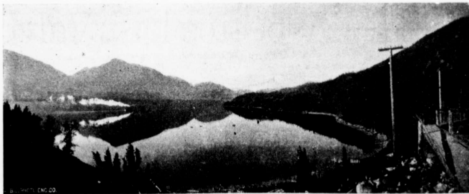
SLOCAN LAKE AND S.S. "SLOCAN."

Ruth. —Since last February practically nothing has been done on this property, a few men only being employed only in development work. The mill has not been operated since then. The lowest level is being driven ahead and in the spring the mine will be in a