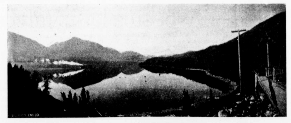
SLOCAN LAKE AND S.S. "SLOCAN."

Ruth. —Since last February practically nothing has been done on this property, a few men only being employed only in development work. The mill has not been operated since then. The lowest level is being driven ahead and in the spring the mine will be in a