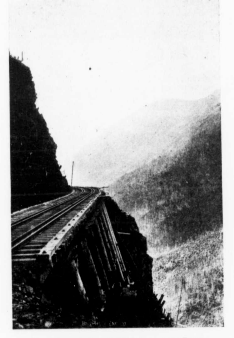
PAYNE BLUFF ON K. & S. RAILWAY, 1,000 FEET BELOW.

is a double-track tunnel, and is one of the best and largest tunnels in the Slocan. A force of about 60 men is employed and shipments are being made at the rate of two cars of ore per week. A quantity of ore has lately been discovered in the old upper workings, which were supposed to be stoped out. Air for the tunnel