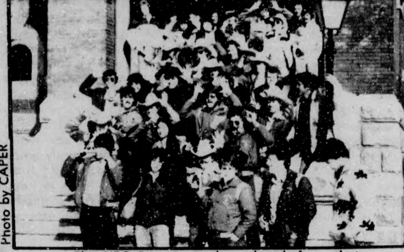
The UBC Foresters take a break from their busy schedule to smile for the camera.

the UNBer's head west for a full week of BC hospitality.