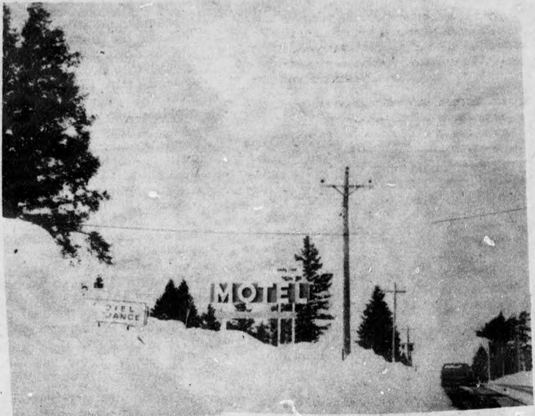
Across the road from this motel a pipe leads to the river dumping untreated sewage into the St. John River.

For ALL Your Photographic Equipment & Supplies Cameras , Films , Portraits , Graduation Photos Thank you for your patronage and Best of Luck on your exams.