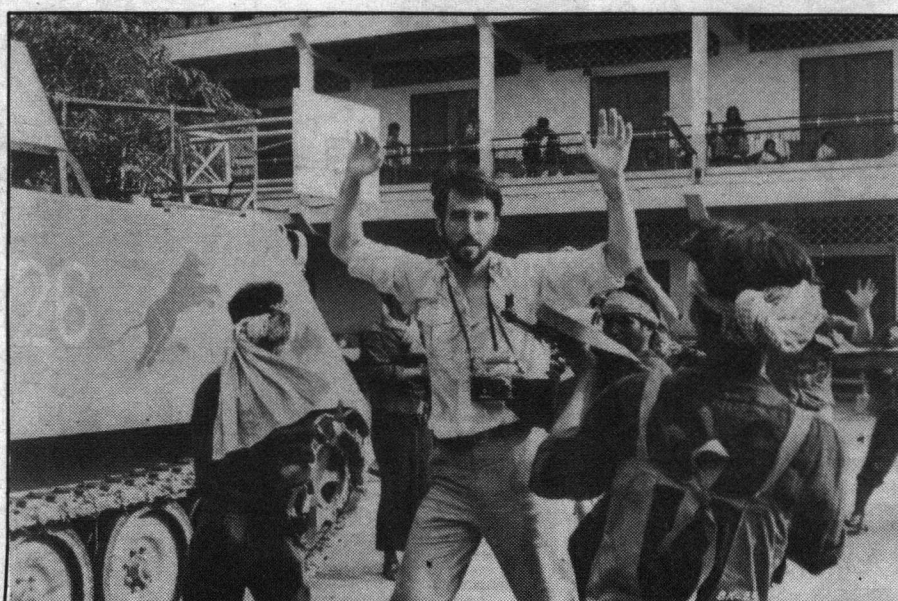
Twentieth Century Fox's Lost in Hanoi became famous for its realistic portrayal of foreign tourists caught with pre-set spending limits on their American Express cards.