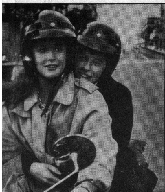
ictures' The Story of a Virgin High School Boy Getting Laid by could mean a possible influx of a few more films of this