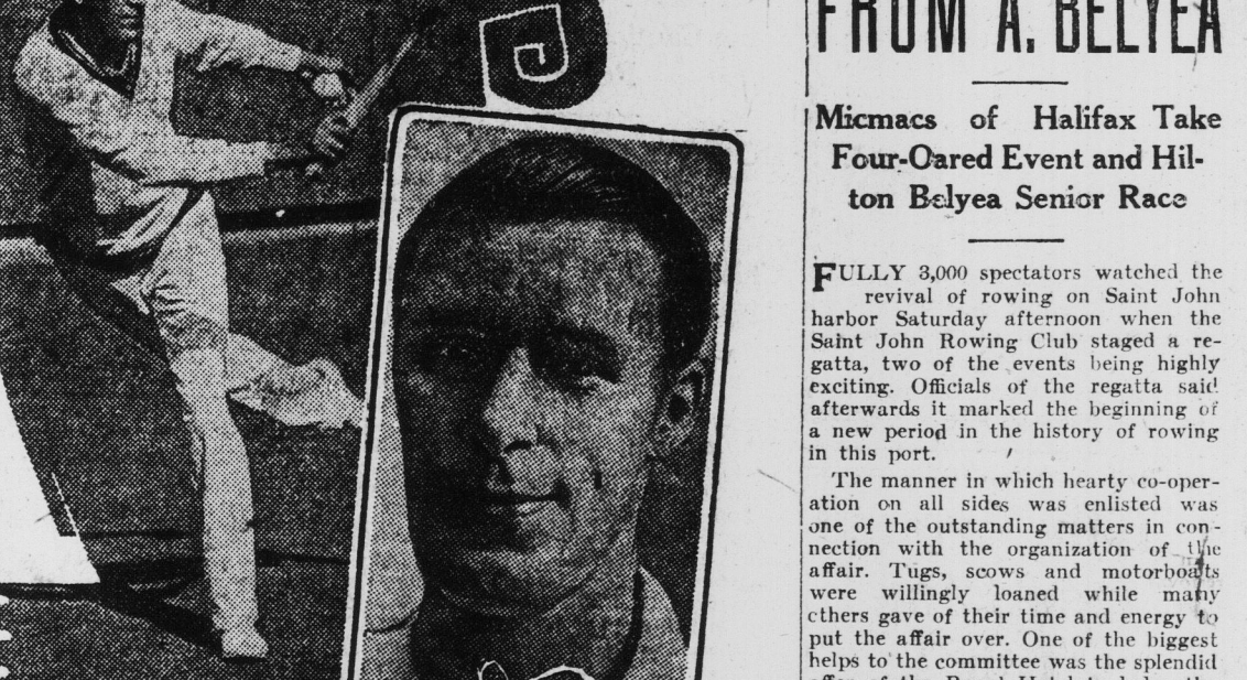
"Big Bill" Tilden, who suffered his first defeat in seven years of Davis Cup team competition, when he lost a sensational four set match to Rine Lacoste, of France, at Philadelphia on Saturday. The scores were 4-6, 6-4, 6-4, 6-8. Tilden suffered a badly twisted knee.