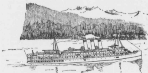
Canadian Pacific Steamer "Princess Charlotte" British Columbia Coast Service