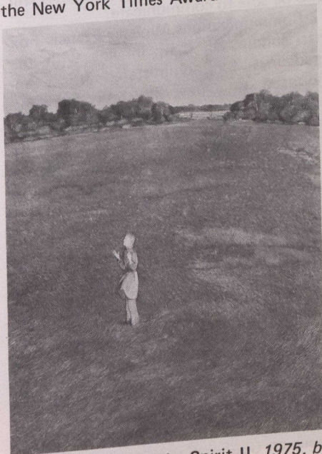
By The Breath of the Spirit II, 1975, by William Kurelek.

William Kurelek (1927-1977) was born in Alberta and received post-secondary education and some art training in Manitoba, Toronto, Mexico and England. In addition to painting, he illustrated a number of books, two of which received the New York Times Award for best illu-