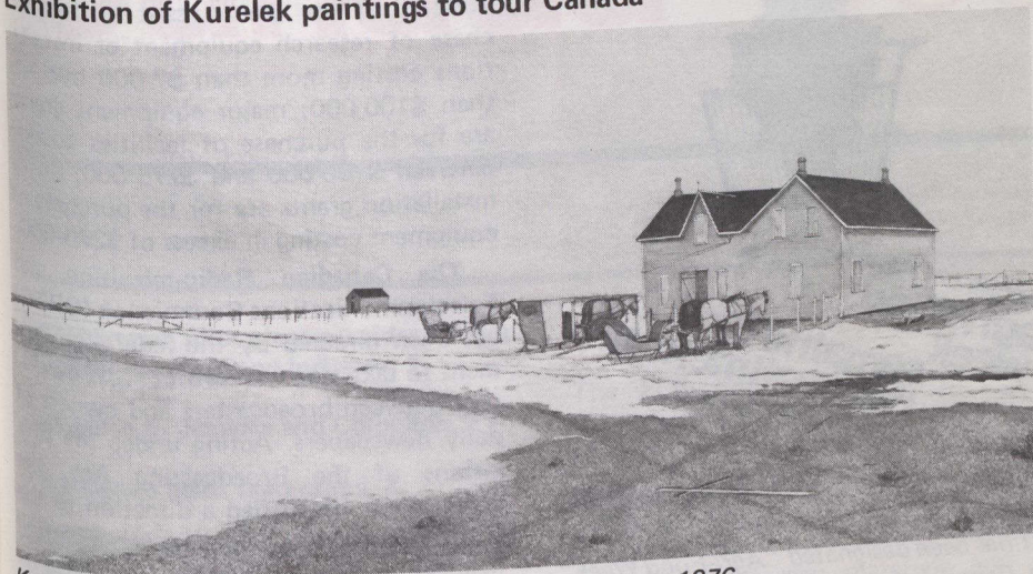
Kurelek's Trustees Meeting on the Barber Farm, Regina, 1976.

Kurelek's Vision of Canada , the first exhibition dealing with the complete works of Canadian painter William Kurelek, is scheduled to open at the Kitchener-Waterloo Art Gallery on November 18 and then tour 14 other museums and galleries in Canada's ten provinces through 1984.