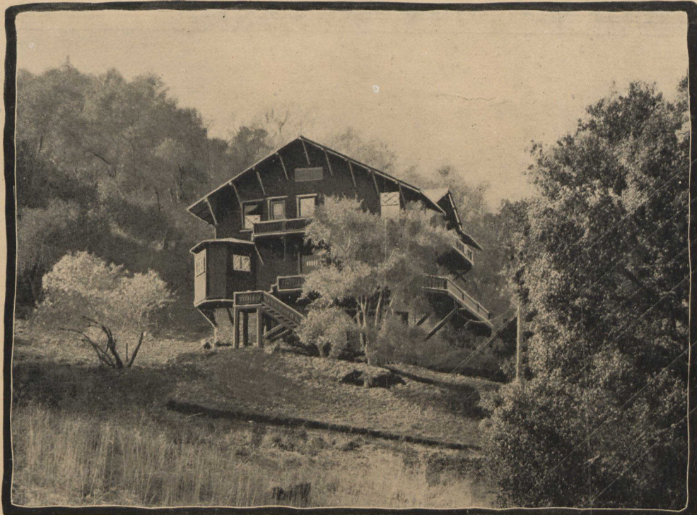
Bungalow Design and Construction See Page 40