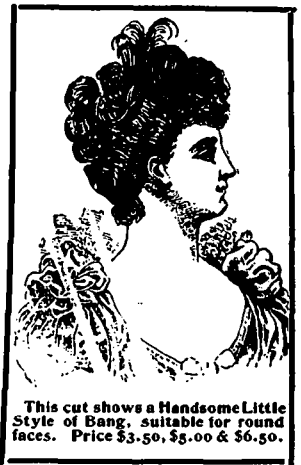
This cut shows a Handsome Little Style of Bang, suitable for round faces. Price $3.50, $5.00 & $6.50.

J. Trancle-Armand & Co. 441 Yonge and 1 Carlton Sts., Toronto, Canada. TELEPHONE 2498. When ordering please mention this magazine.