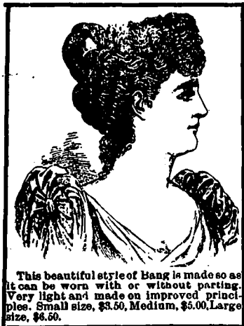
This beautiful style of Bang is made so as it can be worn with or without parting. Very light and made on improved principles. Small size, $3.50, Medium, $5.00, Large size, $6.00.

Armand's Eau d'Or for dull and orless hair. A most reliable preparation for tightening and lightening the hair, w o thou bleaching it. Makes the hair grow. Innocent as water. Price, $1.00 per bottle.