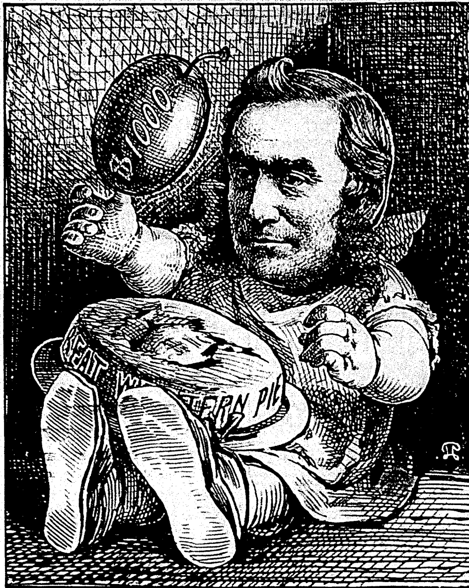
Little Jack Horner sat in a corner, Eating his Christmas pie; He put in his thumb and he pulled out a plum, Says he "What a good boy am I!"