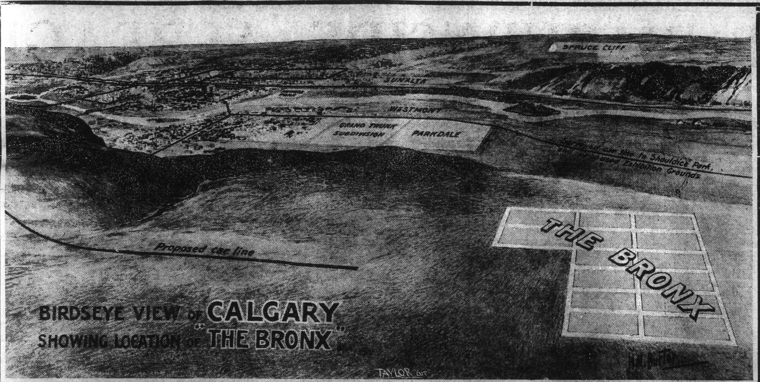
BIRDSEYE VIEW OF CALGARY SHOWING LOCATION OF "THE BRONX"

OVERLOOKING THE CITY FROM NORTH-WEST OF THE BRONX. SPLENDID VIEW OF THE ROCKIES, THE RIVER, AND ASSURED CAR LINE ROUTE FROM PROPERTY