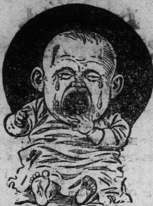
"Open Every Night."

"The Government of the United States feels it necessary to state that it takes for granted that the Imperial German Government does not intend to imply that the maintenance of its newly announced policy is in any way contingent upon the course of results of diplomatic negotiations between the Government of the United States and any other belligerent Government, notwithstanding the fact that certain passages in the Imperial Government's note of the fourth instant might appear to be susceptible of that construction. In order, however, to avoid any possible misunderstanding the Government of the United States notifies the Imperial Government that it cannot, for a moment, entertain, much less discuss, a suggestion that respect by German naval authorities for the rights of citizens of the United States upon the high seas should, in any way, or in the slightest degree, be made contingent upon the conduct of any other Government affecting the rights of neutrals and non-combatants. Responsibility in such matters is single not joint, absolute, not relative.