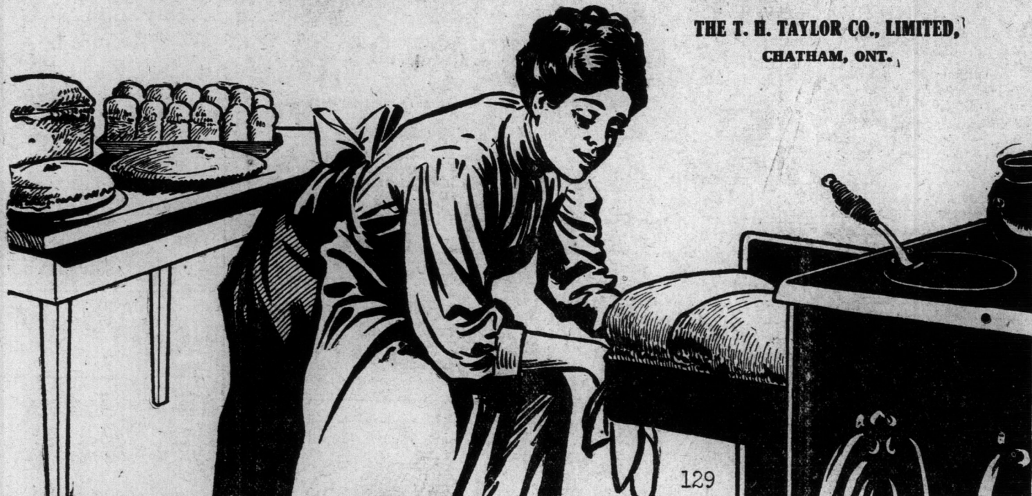
R. G. ASH & CO., St. John's, Sole Agents in Nfld., will be pleased to quote prices.

THE T. H. TAYLOR CO., LIMITED, CHATHAM, ONT.