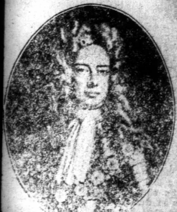
Duch of Marlborough, Third Governor.