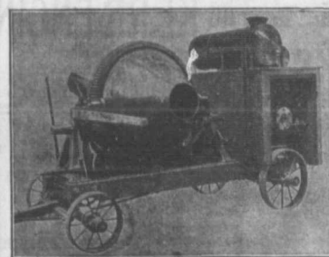
No. 1 Smith Mixer on Trucks With Gasoline Engine.

Office and Salesroom, 298-300-302 W. Jackson Boul. CHICAGO, ILL., U. S. A.