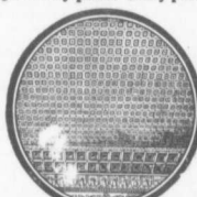
Pedlar Art Steel Ceilings adorn and protect. Cannot crack. Seams invisible. Hundreds of new styles ready.