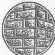
Pedlar Steel Siding armors a building against fire and wet. Handsome enough for any place. Many patterns.