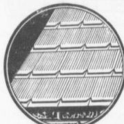
Oshawa Shingles protect any roof perfectly. Good for 100 years. Guaranteed for 25 years. Cost little

And, in summer's blazing sun, you will find the interior of a Pedlarized building cooler than any brick building in your neighborhood. Roof, walls and ceilings of heavy sheet steel bar the entry of the heat. Cooler in summer, warmer in winter; dry at all seasons—this is what Pedlarizing does for houses, barns, any building. And it does more. For Pedlar Art Steel Ceilings and Side Walls, beautifully embossed in deep, richly-ornamental patterns, can be decorated in any color scheme you prefer; and yet these ceilings and walls, without a crevice or a seam to harbor dirt, dust, germs or vermin, can be washed as you would wash a pane of glass! If there has been disease in a Pedlarized room, the whole interior can be scrubbed with antiseptics and made really sanitary. Any room in a Pedlarized house can be kept clean with the least effort. Pedlarizing makes buildings healthful—as well as fireproof, damp-proof, warmer in winter, cooler in summer.