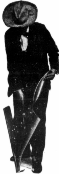
Only One Nut to Remove

This is mighty important, because any time saved during the plowing season is money saved to the farmer.