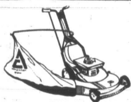
22-inch Self-Propelled Rotary?