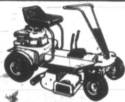
26-Inch 6-HP Riding Mower?