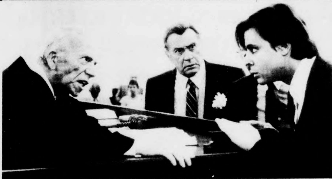
HERE COMES THE JUDGE: Ray Walston blows up at Judd Nelson while Darren McGavin looks aghast. From the Hip , by Porky's director Bob Clark, had good intentions but combines comedy and a strong dramatic performance by John Hurt to mediocre results.

"Clark's people phoned back a couple of more times and finally told my agent they had (another actor) for the role, but they were still interested in me," Walston continued. "I finally asked my agent for the name