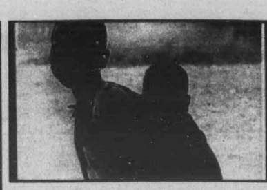
Send your gift of support to families in developing countries in Africa and Asia

BRUNSWICKAN OFFICES STUDENT UNION BUILDING