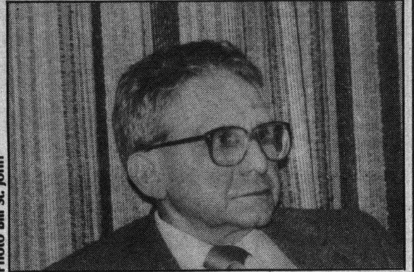
Shaffer: Government holding a pie in the sky.

If it does so, "we'll have the socialization of risk with the privat-