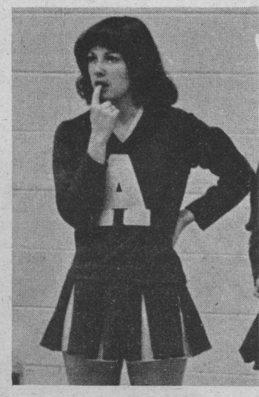
Girl watchers were winners too, as Bears beat U of S twice at Varsity Gym last weekend. Pandas dropped both their contests to Huskiettes.