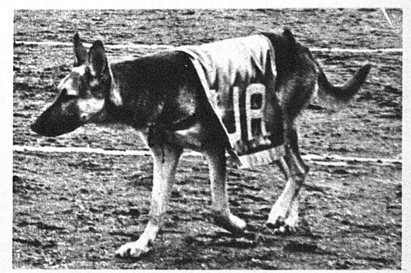
FOUR-LEGGED FRIEND OF THE MARCHING BAND ... walks off with performing fleas

The past three years have seen the development of an organization which is the source of pride and enthusiasm for those who have understood our purposes. Hopefully the future will see the bands grow carefully in quantity and quality until we can fulfil those purposes to a much greater extent.