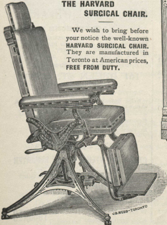
The Harvard in the upright position with head rest folded back.

We wish to bring before your notice the well-known HARVARD SURGICAL CHAIR. They are manufactured in Toronto at American prices, FREE FROM DUTY.