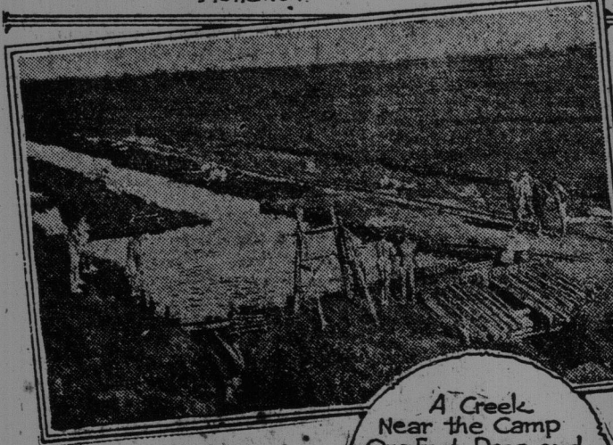
A Creek Near the Camp One Foot Deep and Two Feet Wide Which the British Officers Were Permitted to Dig. Note the Bleak Outlook.