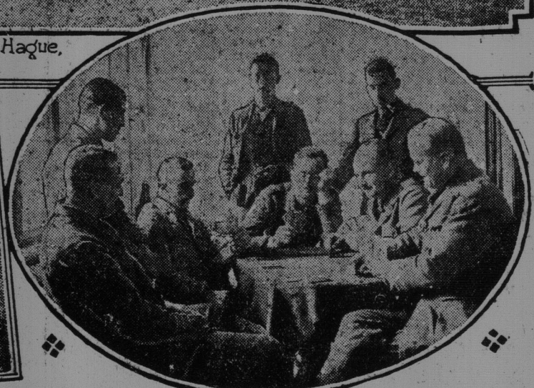
Killing Time at Bischofswerda Camp, Saxony. Session in Progress.

"Why should Canada wait any longer to test the efficiency of the airplane in forest fire protection?" asks the Canadian Forestry Journal. The question has been thrashed out for nearly three years, and while responsibility for the initial experiments has been passed along from one authority to another, the opinion of most of those who have made a close study of the subject is that the dominion government, with a ready supply of idle machines and willing pilots, ought to take the first steps to secure reliable data in this most important enterprise. According to the Forestry Journal's information, the minister of lands and forests of Quebec recently proposed to the dominion minister of marine and fisheries that two of the idle hydro-airplanes now at Halifax or other Atlantic ports should be loaned to the Quebec government for the summer season of