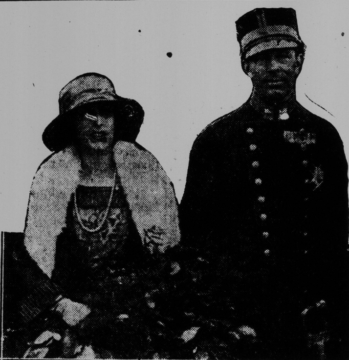
Crown Prince and Princess of Sweden who are shortly coming to this continent on their world tour. They will visit Canada at Niagara Falls and district. The princess is a cousin of King George and was formerly Princess Louise of Mountbatten. She is the Crown Prince's second English wife, his first being Princess Margaret of Connaught.