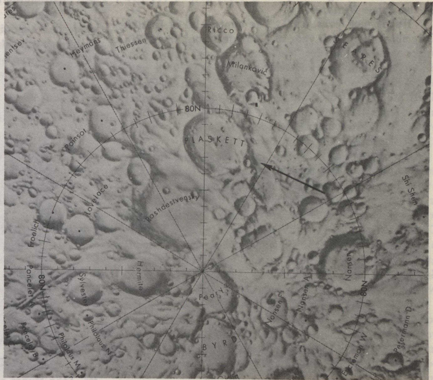
PLASKETT, an 80-mile crater near the north pole of the moon.