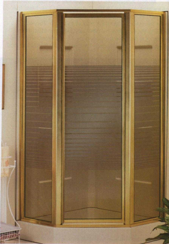
The Manhattan shower doors offer the ultimate in quality and design.