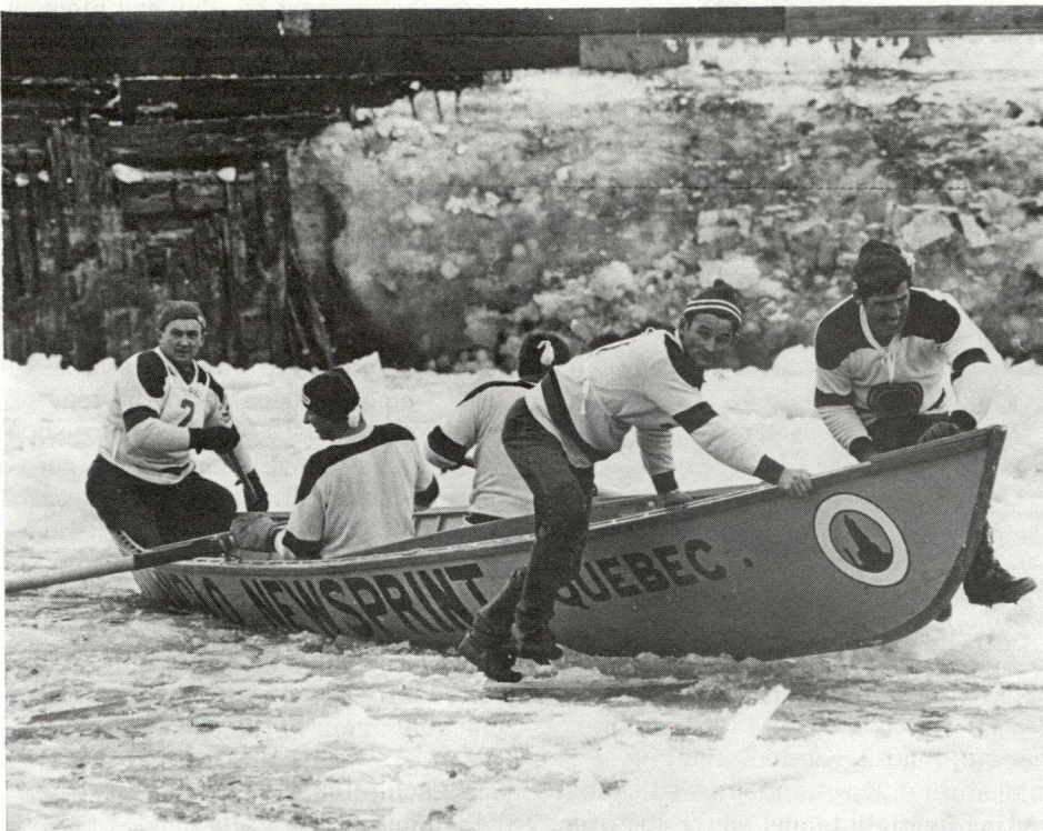
Canoe races are a tradition of the Quebec carnival.