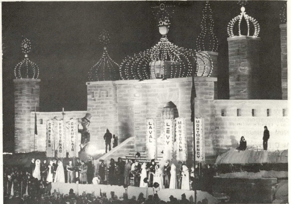
Ice palace where visitors not enjoying themselves are "imprisoned".

sculptures. Built or carved out of snow these spectacular and often intricate sculptures are taken from legends, cartoons and history. Some are complex groupings of two or more figures and they present an impressive sight, lined up on the quaint, narrow streets of Quebec's capital. Several streets are closed to traffic so that pedestrians