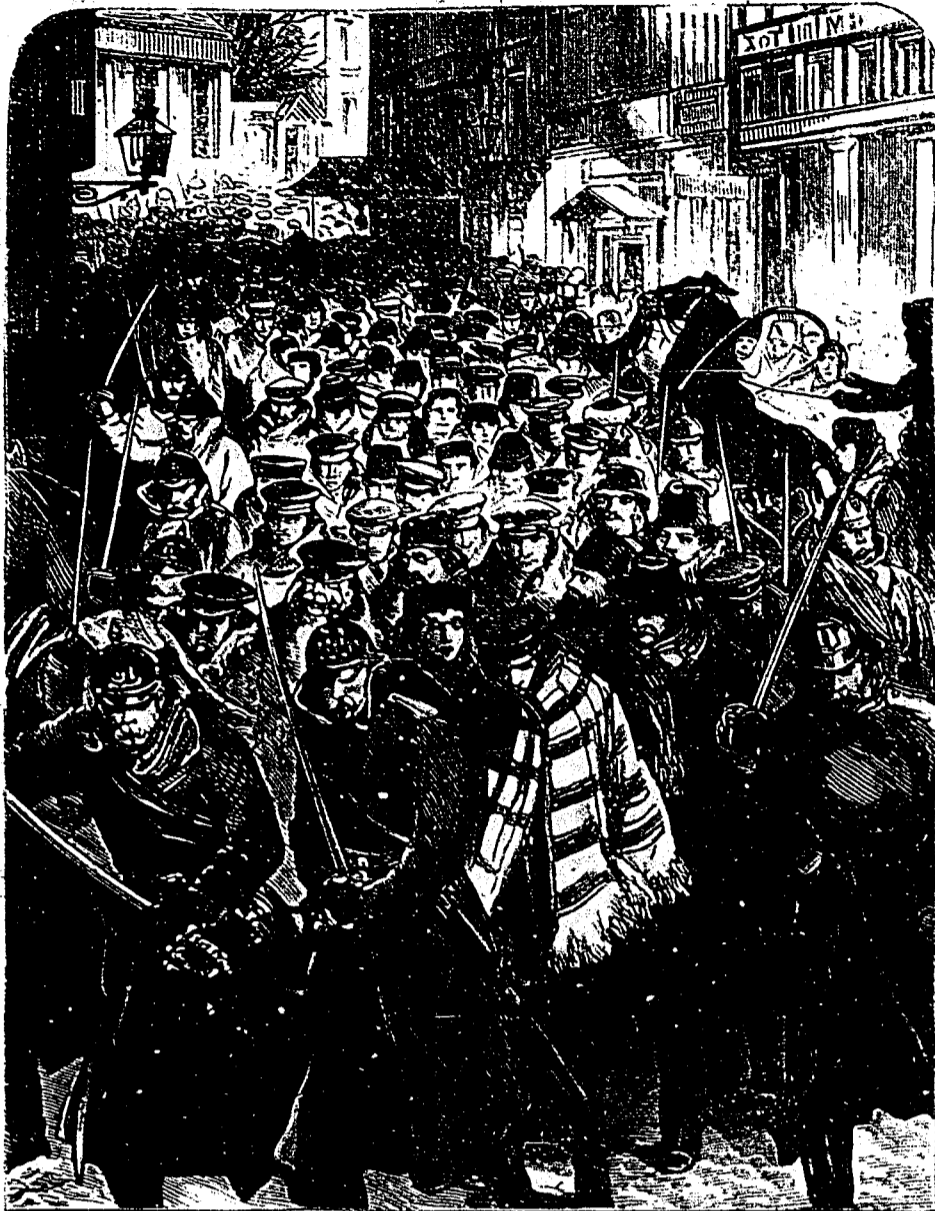
AN ARREST OF STUDENTS AT MOSCOW

50 All Gold, Chromo and Lithograph Cards. (No 2, Allike.) With Name, 10c. 25 Filtration Cards, 10c. Game of Authors, 15c. Autograph Album, 20c. All 50c. Clinton Bros., Clintonville, Conn.