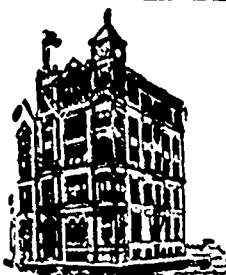
HEAD OFFICE BUILDING, MONTREAL