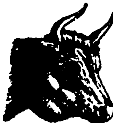
Trade Mark Reg'd.

Lump Jaw has heretofore baffled treatment. It has infected herds and pastures, and caused loss of hundreds of thousands of dollars. This new remedy cures quickly, thoroughly, and permanently. Leaves jaw smooth and sound. Easy to apply; costs but a trifle compared with results.