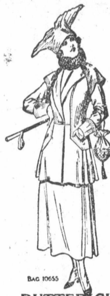
BUTTERICK PATTERNS COAT 9397 SKIRT 9391

Special Display of Dress Goods and Silks—We Want You to Call on Fair Days and see Our Grand Showing.