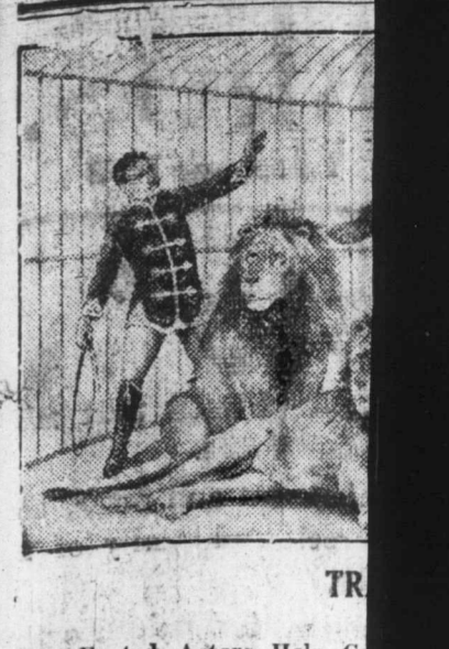
Four-footed Actors Help Gaining Circus Profits