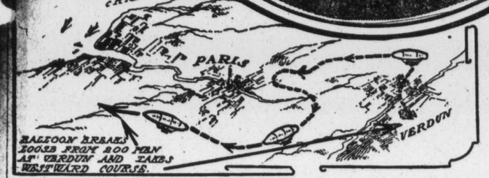
Diagram sketch showing the locality of escape of the runaway airship (La Patrie), and the direction taken by the aerial derelict.

Flight of Lebaudy's military airship La Patrie, from a photograph showing the great craft in the process of sailing against the wind.