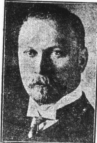
Smuts the Diplomat.

The Great War caused 70,000,000 men to be mobilized; of these 30,000,000 were wounded, and 9,000,000 killed.